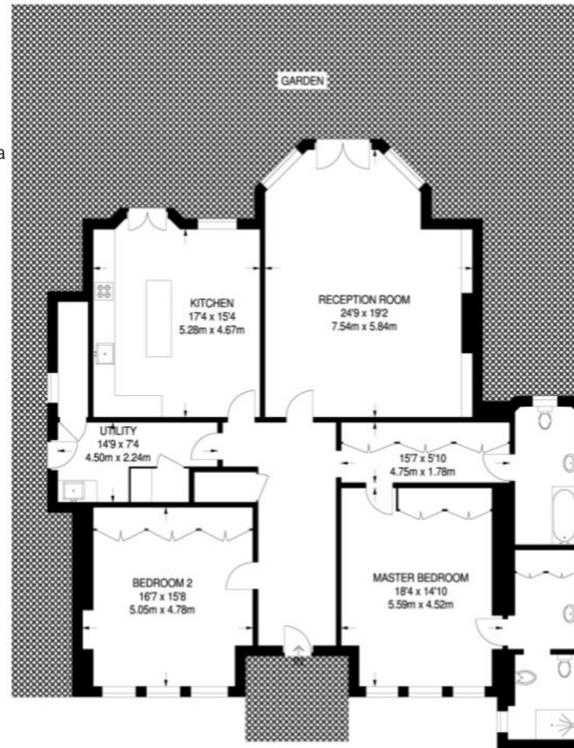
GROUND FLOOR 1902 SQ FT / 176.7 SQ M

Great transport links with St John's Wood Tube and High Street within close proximity, with amenities just a short walk away. Other local attractions include Primrose Hill Village and the open spaces Regents Park.